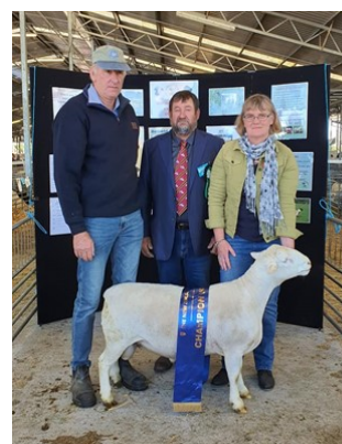
Champion White Dorper Ram Belfield Park 3/18