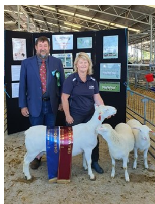
Champion & Grand White Dorper Ewe Kilmarnock 24/16