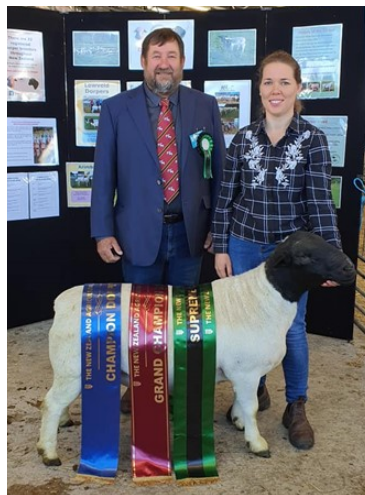
Champion Dorper Ram, Grand Champion Ram and Supreme Dorper exhibit—Lowveld 381/17