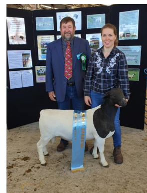
Reserve Champion Dorper Ram Lowveld 434/18