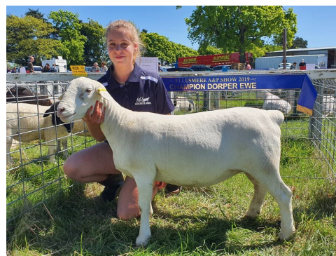
Champion Ewe—Kilmarnock 15/18