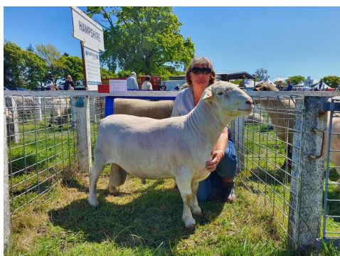
Reserve Champion Ram—Slopehill 6/16