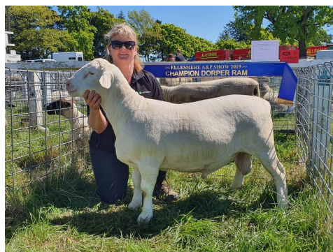
Champion Ram—Kilmarnock 190/18

If you are keen to host a future Feature Show please let us know.