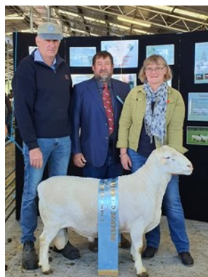
Reserve Champion White Dorper Ram Slopehill 6/16