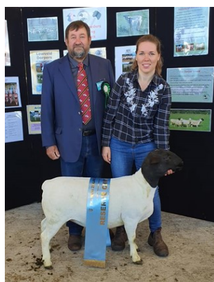
Reserve Champion Dorper Ewe Lowveld 420/18