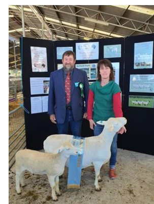
Reserve Champion White Dorper Ewe Winton 95/15

Full results can be found : https://www.theshow.co.nz/competitions/results/Sheep 2019