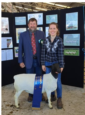
Champion Dorper Ewe Lowveld 425/18