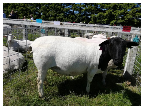
Reserve Champion Ewe—Maple 724/17