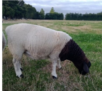
✗ Less preferred photo