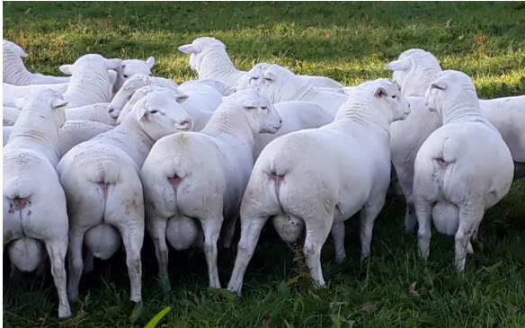
✓ Preferred photo

Please submit your photos through Greg @ greg@nzsheep.co.nz