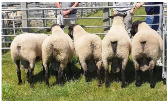
Top five.... 'The bottom end'