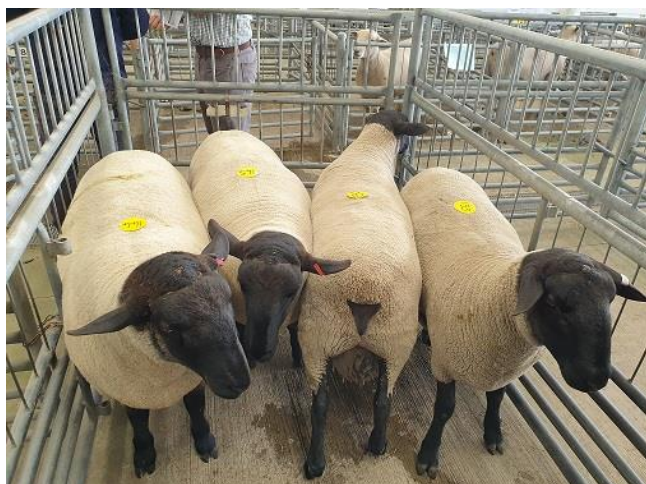
PRETTY BOYZZZ... (2nd, 3rd, 1st, 4th Left >>> Right)