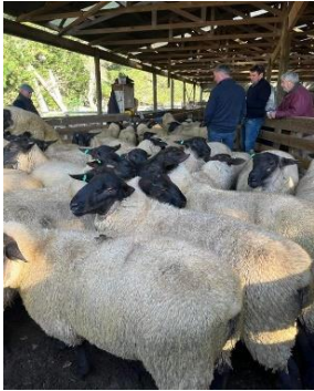
'PINEGROVE' Ram Hoggets