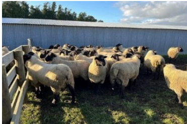
'LIMAVADY' Ram Hoggets & MA Ewes