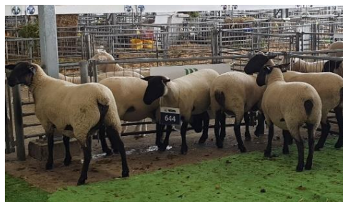
'The girls Brigade'