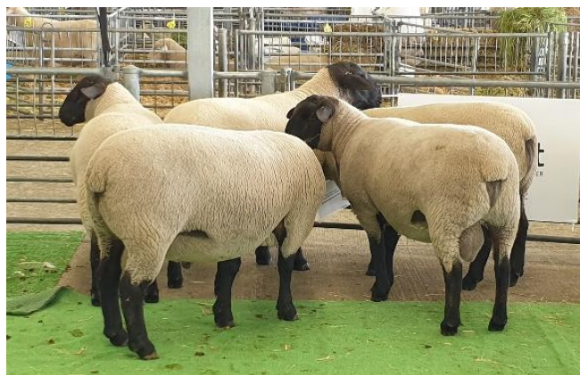
Chocka full of meat !!